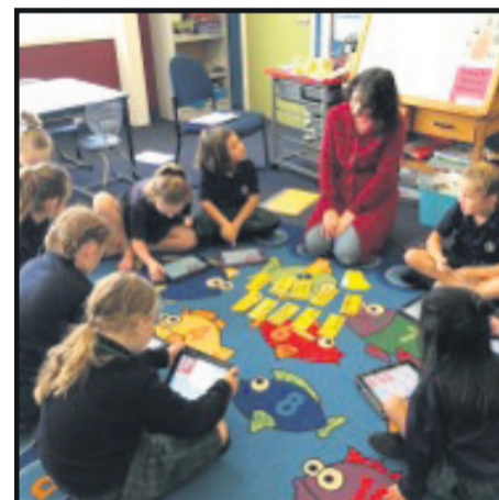
Technology at use during a maths lesson in the Year 2 class.

A wide variety of different speakers ensured that everyone took away with them a message of joy, goodwill, hope and encouragement. St Joseph's was given an iPad in recognition of the commitment they made to have all of their staff and BOT attend. The school would like to acknowledge the financial assistance provided to them by Pub Charities, which was used to fund the registrations for the staff and Board to attend this amazing event.