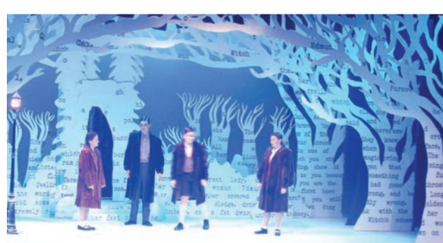
The children in the wood.