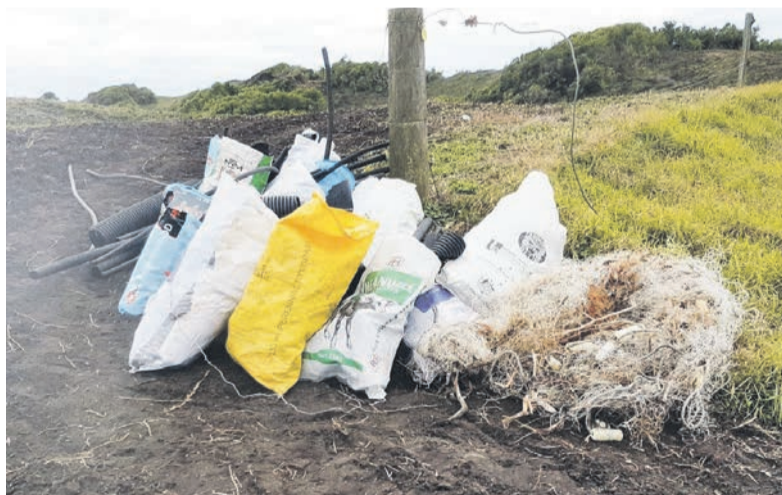
The half tonne of plastic that was picked up from Manihi Beach on the Sunday after the screening.