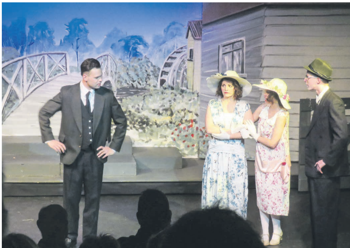
From left Gus, Rosie, Violet and Mark in Me 'n' Gus.