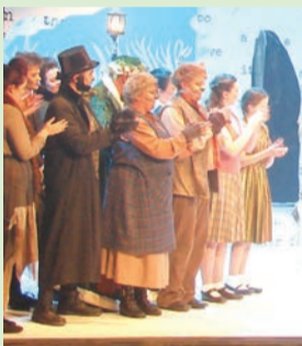
The Lion, the Witch and the Wardrobe a great treat. Page 5.