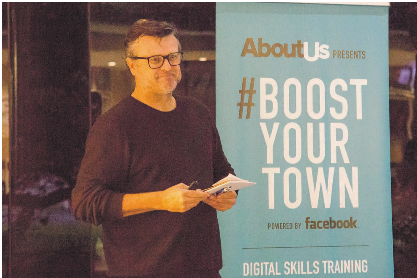
A digital workshop to be held in New Plymouth on July 26, co-hosted by the Wheelhouse.