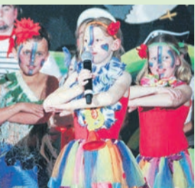
Pirates take over Coastal Taranaki School. Page 9.