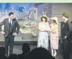
Me 'n' Gus, the musical. Back page.