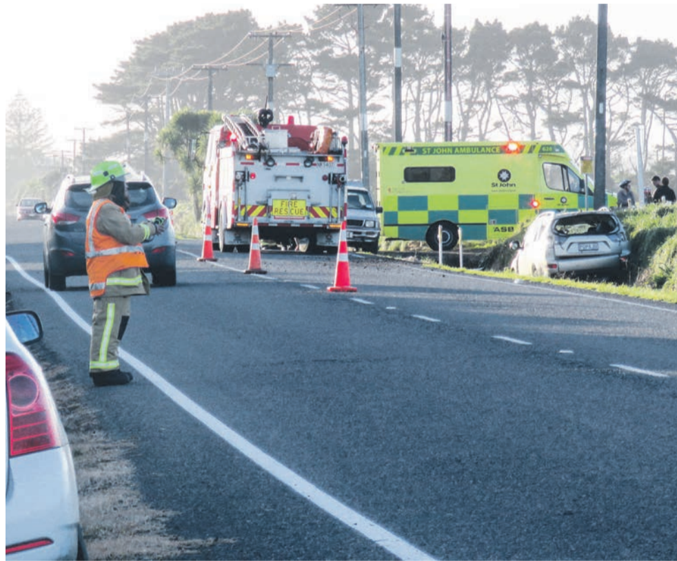
Shortly after 4pm on Tuesday Opunake emergency services were called to a single vehicle accident on Surf Highway between Opunake and Oaonui.