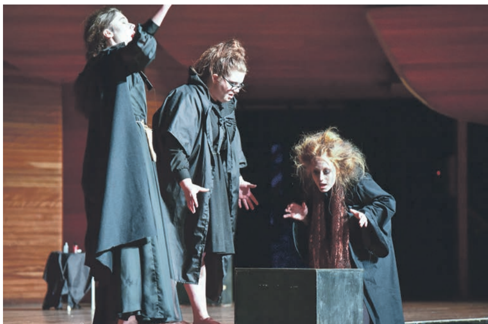
Sacred Heart College Students perform McBeth .

The Supreme Winner of this and of the SGCNZ/Morrison Music Trust Shakespeare Music Composition Competition join the 46 young actors and student-directors selected from the 24 Regional and National Festivals to spend a week together, this year in Dunedin, for SGCNZ's National Shakespeare Schools Production (SGCNZ NSSP) – a intensive week of workshops, tours, rehearsals and culminating public performances.