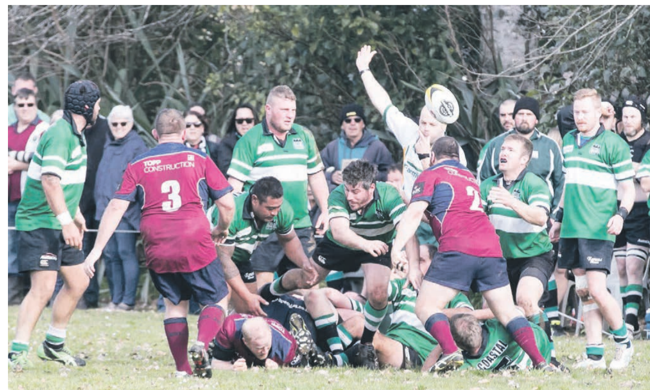
Lots of action in the Division 2 final against Inglewood.