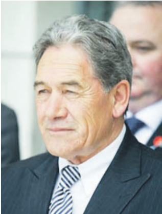
Winston Peters, Acting Prime Minister.

The funding will be used to scope the engineering and design of two hydrogen generation facilities, up to four mobile compressed hydrogen storage and