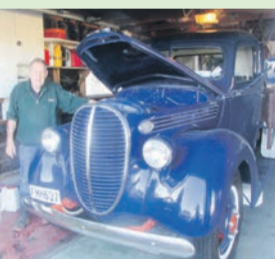
Driving trucks for 50 years. Page 17.