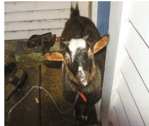
I just want to come in!