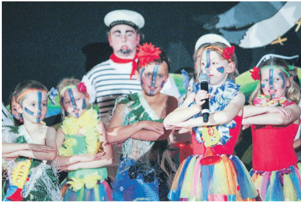
The islanders of Lombago.