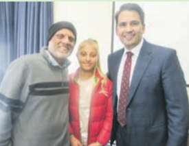
National Party leader in Hawera. Page 7.