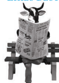
Look for the Newspaper Reading Cow on our newstands

OPUNAKE & COASTAL NEWS THE NEWSPAPER TARANAKI LIKES BEST