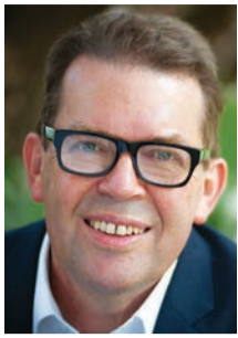
JONATHAN YOUNG MP FOR NEW PLYMOUTH

While the investment in developing hydrogen fuel infrastructure in Taranaki announced last week is welcome, it does not make up for the Government's reckless decision to ban oil and gas exploration.