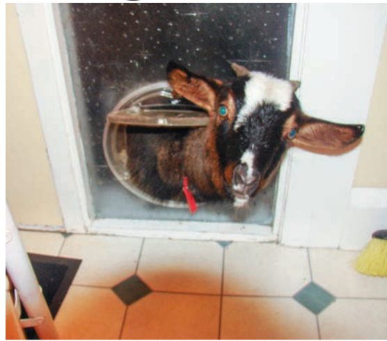
An unexpected visitor as seen through the cat flap.

driveway seeking a gate near to take refuge behind. That the bottom where I intended didn't work - the goat was