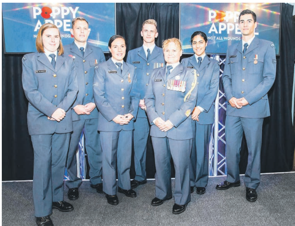
RSA Poppy Appeal 2018 shines a light on Veterans' mental health.

"We are grateful for the fantastic public support through donating on and around Poppy Day; for all our volunteers who contribute their time and effort; and for our corporate partners who contribute so generously