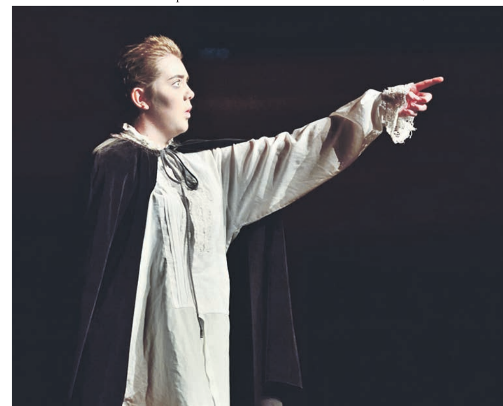
Students performed at the annual Sheilah Winn Shakespeare festival in Wellington.